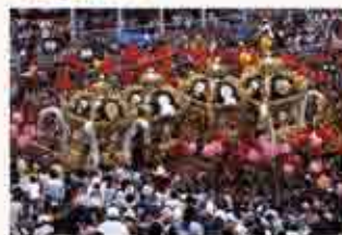
Nada no Kenka Matsuri