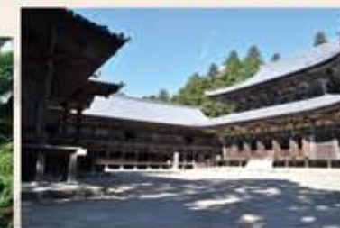
Daikodo, Jogyodo, Jikido(Mitsunodo)

Engyoji Temple on the top of Mt. Shosha has a long history of over 1,000 years, and has a lot of ancient religious architecture.