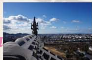
View from the top floor