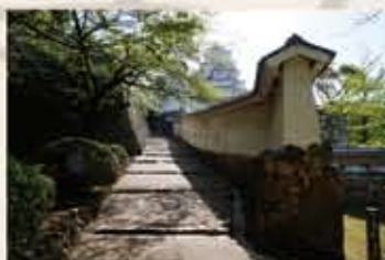
Slope to Ha-no-mon