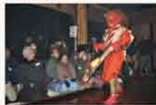
Onioi at Shosha