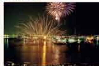
Himeji Minato Matsuri